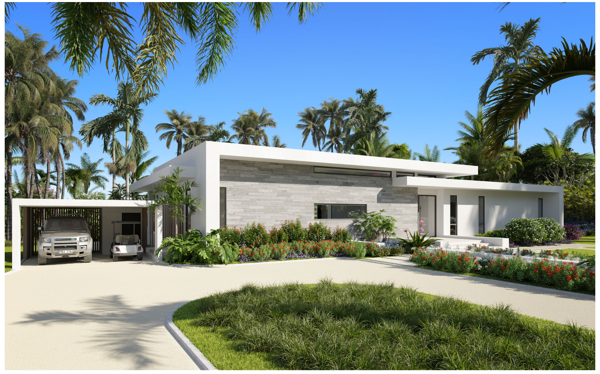
All images are subject to modification at the discretion of the developer and to the final design of the home. All exterior views are subject to the home's position within the development.